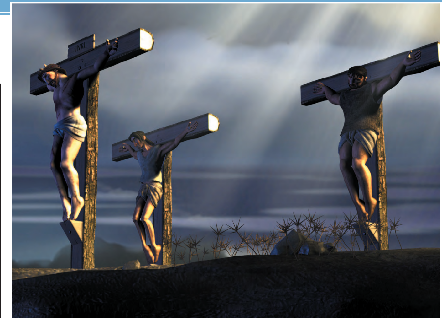
3D: Friends and Heroes is a clever mixture of traditional 2D animation for the scenes involving Macky and Portia, and 3D scenes from the Bible (left and above)