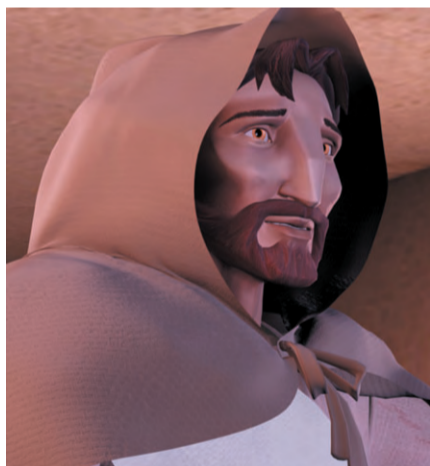
Our star: Superb 3D graphic render Jesus alive in the series

broadcasters, not just those broadcasting Christian material.