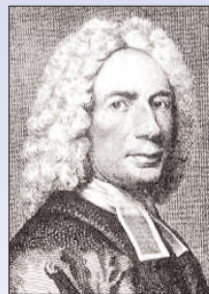
Isaac Watts (1674-1748) still widely sung today - 'the father of English Hymnody'

Hymns of the Victorian Era: Hymns of the Twentieth Century