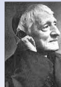
John H. Newman (1801-90) academic, highly influential in his time; in later life appointed Cardinal